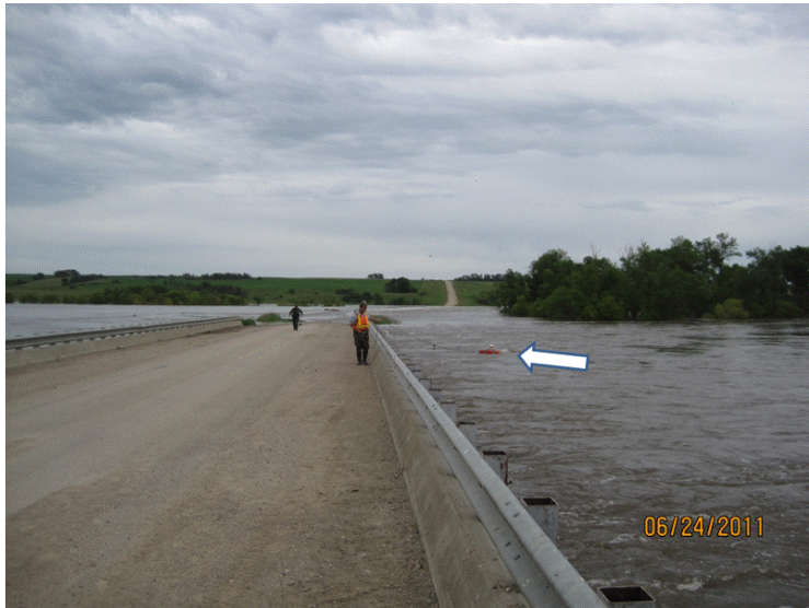
Figure 2. Discharge measurement on Souris River, ND made using towed current meter (arrow)

For example, the Souris River in North Dakota was quickly measured by towing an acoustic Doppler current profiler across the channel (fig. 2).