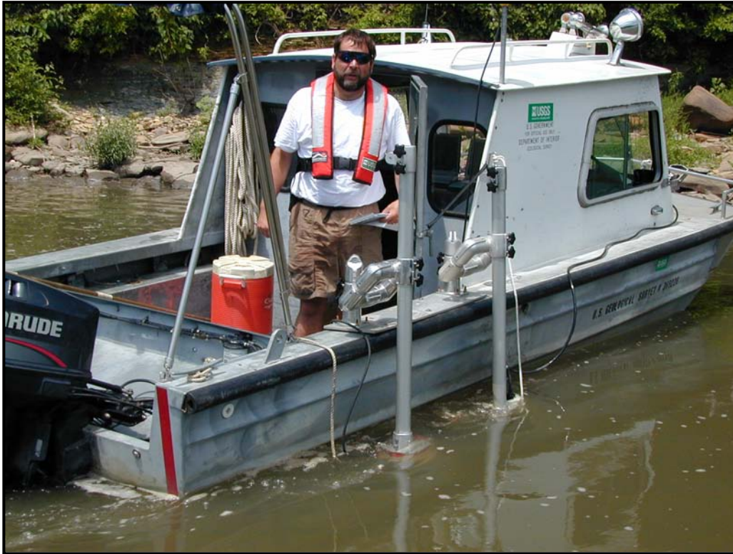
Figure 1. A typical boat and ADCP for making discharge measurements. This boat is set up for suspending and testing two ADCPs.

ADCPs and acoustic Doppler velocimeters (ADV) are rapidly replacing the Price AA current meters and pygmy meters that most of us used during our streamgaging days. These instruments operate on the Doppler principle or the frequency shift that occurs when successive acoustic pulses are transmitted from and reflected back to the instrument from particles suspended in the water column. The difference in the frequency shift is proportional to the relative velocity between the instrument and the suspended particles. An ADCP can be mounted on a powerboat, a remote-controlled boat or a tethered raft deployed from a bridge or cableway. It transmits acoustic pulses and receives reflected signals from 3 beams. An ADP is mounted to a wading rod, and it transmits a single beam and has three probes for receiving the reflected signals. The output of the ADCPs provides a continuous recording of depth and velocity profile as the boat or raft traverses the river. An ADV provides a single velocity observation at the point it is suspended in the water column during a mid-section measurement.