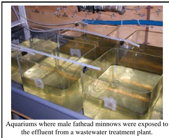
Aquariums where male fathead minnows were exposed to the effluent from a wastewater treatment plant.

Using on-site wastewater exposure experiments, USGS scientists found several chemicals known to be potential endocrine disruptors, such as surfactant (detergent) compounds and their degradation products and bisphenol A (a chemical used in the production of plastics). This study increases the scientific communities' understanding of the potential effects of wastewater on fish in streams, and this information can be use to make better decisions regarding the discharge of wastewater to the environment.