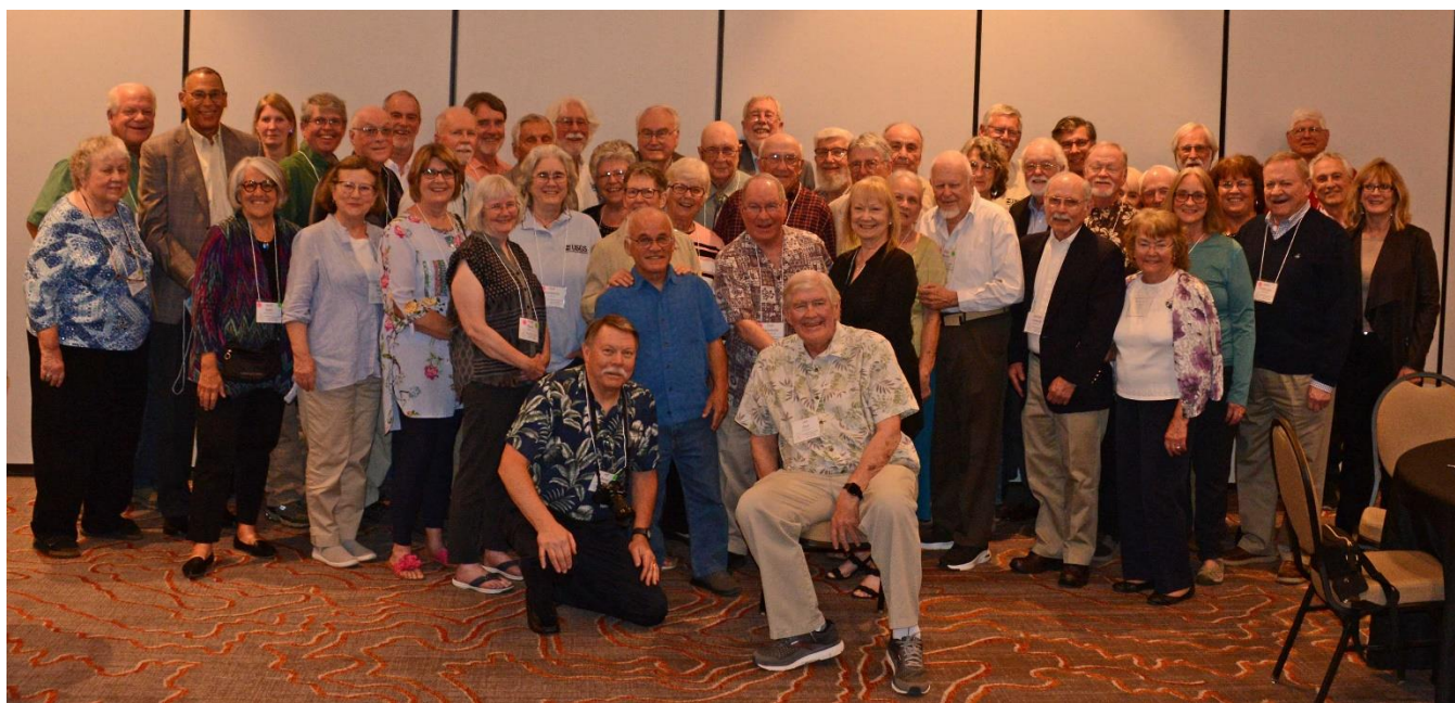
Banquet attendees at the 20 th Reunion in Tucson, AZ—happy to celebrate 50 years as a USGS Retirees' Organization. There could be a prize for correctly naming all with a visible face!

Editor's note: Some pictures from the Reunion in Tucson. Stay tuned for a complete summary of this reunion scheduled for the August issue of the Newsletter.