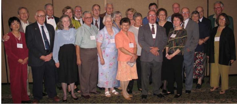
First time attendees at a WRD Retirees Reunion. We know you all had a great time. Please be sure to make the 2008 Reunion in Tampa your second Reunion attended!