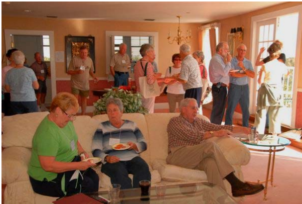
More action in the hospitality suite.