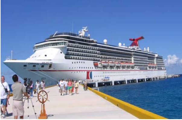
The WRD Retiree cruise ship docked at Cozumel, Mexico.