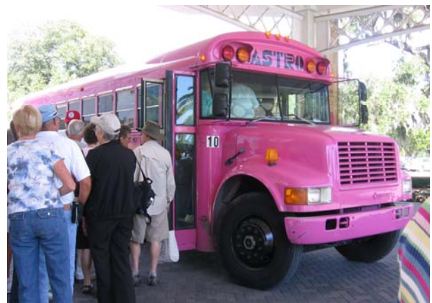
This is a photo of the "Pepto Bismol" bus used for the field trip. Here we see retirees boarding.