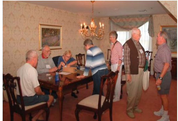
Reunion Registration Desk