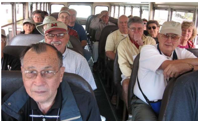
Retirees on one of the fine field trips at the Tampa reunion.