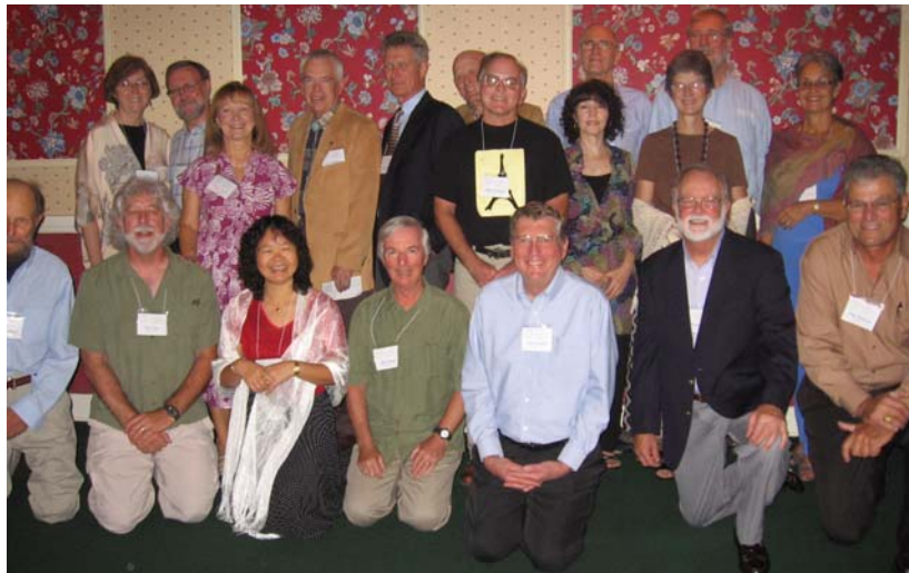
First time attendees for WRD Retiree reunions. Hope to see you at many more Reunions.