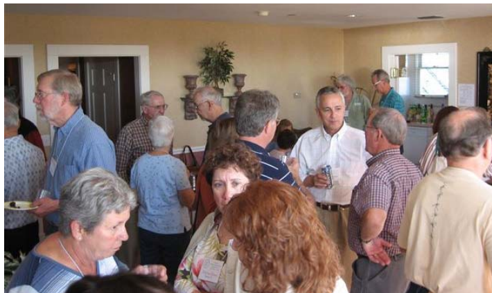
WRD Retirees enjoying the hospitality suite. This is a favorite meeting place.